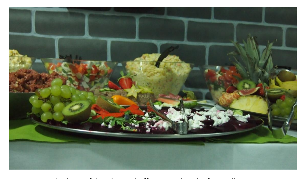
The beautiful and tasty buffet, served at the farewell party

After that the farewell party took place in a club in the city. Again there was fantastic food. After all of us had eaten we were dancing and having fun, enjoying the last evening together.